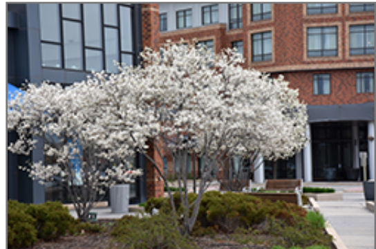
Autumn Brilliance Serviceberry in bloom

Autumn Brilliance Serviceberry is recommended for the following landscape applications;