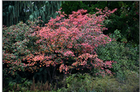
Autumn Brilliance Serviceberry in fall

This tree does best in full sun to partial shade. It prefers to grow in average to moist conditions, and shouldn't be allowed to dry out. It is not particular as to soil type or pH. It is somewhat tolerant of urban pollution. This particular variety is an interspecific hybrid.