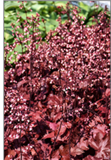
Fire Chief Coral Bells flowers

Fire Chief Coral Bells is recommended for the following landscape applications;