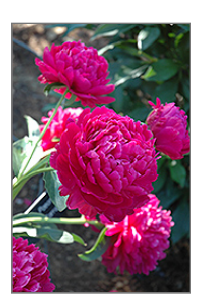
Paul Wild Peony flowers

Paul Wild Peony will grow to be about 30 inches tall at maturity, with a spread of 3 feet. When grown in masses or used as a bedding plant, individual plants should be spaced approximately 30 inches apart. The flower stalks can be weak and so it may require staking in exposed sites or excessively rich soils. It grows at a slow rate, and under ideal conditions can be expected to live for approximately 20 years. As an herbaceous perennial, this plant will usually die back to the crown each winter, and will regrow from the base each spring. Be careful not to disturb the crown in late winter when it may not be readily seen!