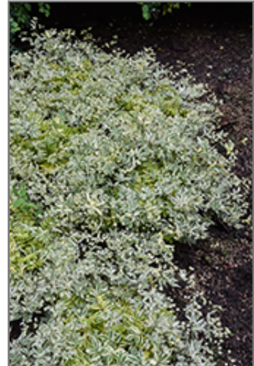
Golden Feathers Jacob's Ladder foliage

Golden Feathers Jacob's Ladder is recommended for the following landscape applications;