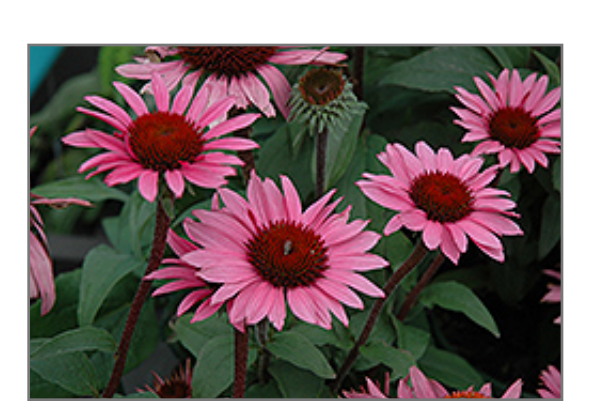
Merlot Coneflower flowers

Glowing, wine colored stems adorned by giant rose-pink flowers with bright orange center cones; fragrant blooms, great for flower arrangements, attracts pollinators and feeds the birds at winter; use in naturalized areas