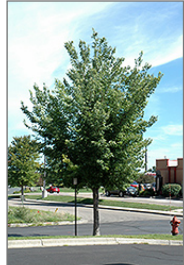
Common Hackberry