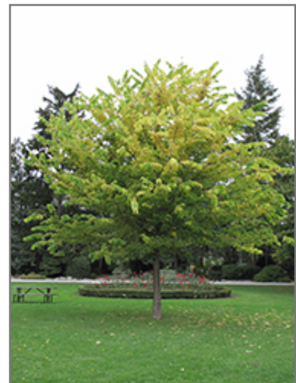
Common Hackberry in fall